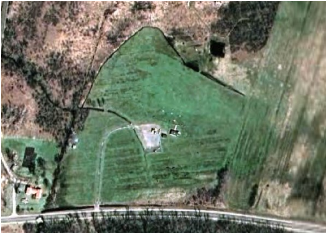
STARS Field Satellite photo